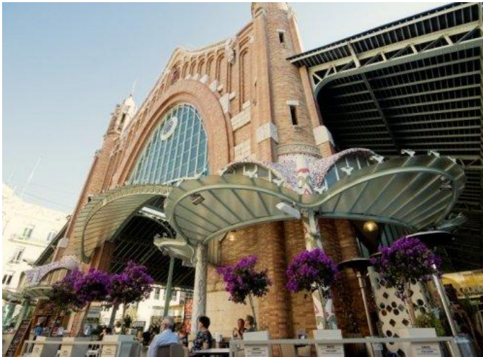
Colón Market and Ruzafa