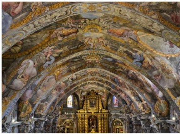
Saint Nicholas frescoes