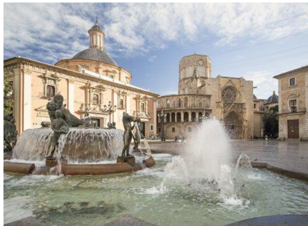
Cathedral and Plaza de la Virgen