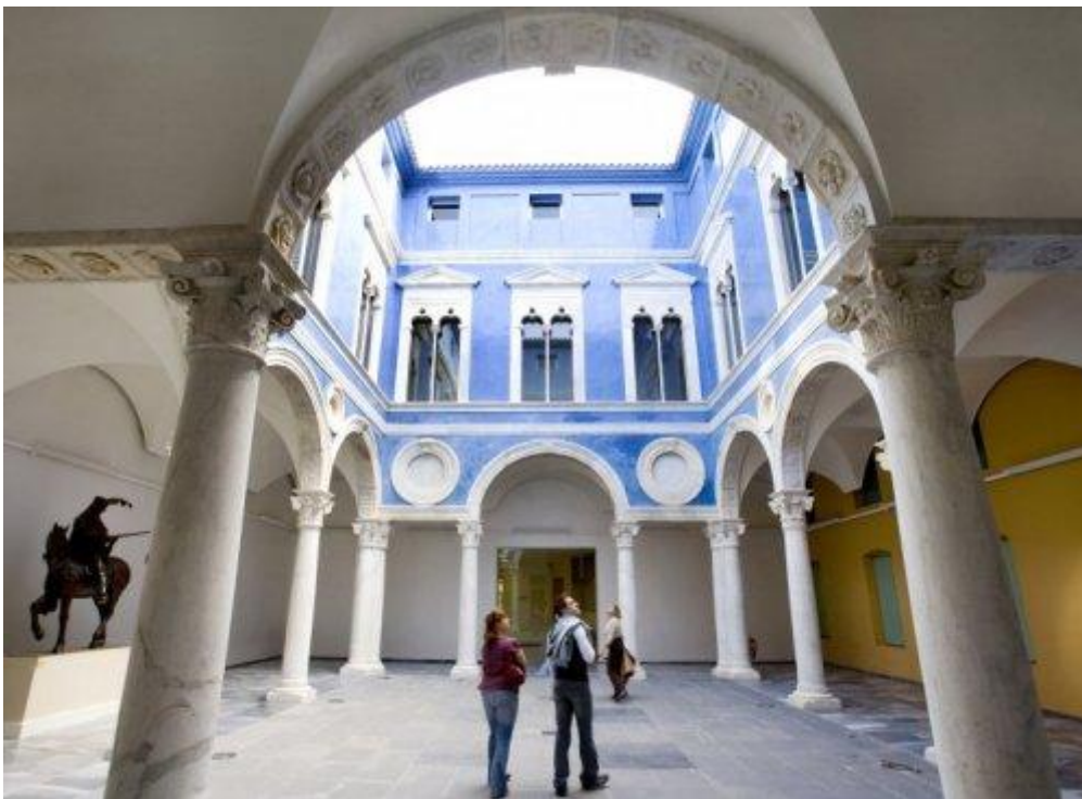
of Fine Arts