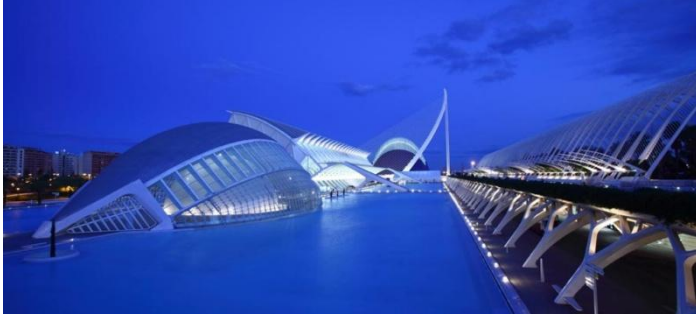
The City of Arts & Sciences

Don't think about it anymore and visit Valencia.