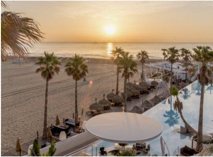
Valencia Marina and its