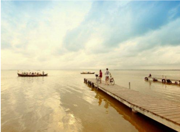
Albufera natural park